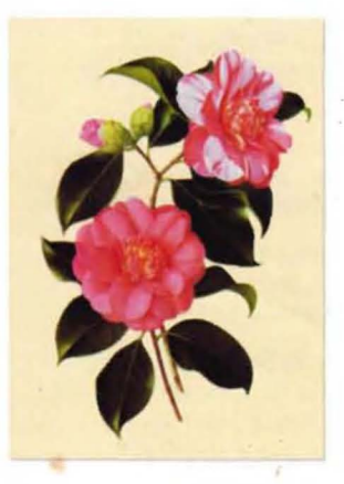
Your friends will enjoy receiving your greetings on these new camellia note cards. They also make great gifts for your fellow camellia lovers or for those you are trying to get involved in this wonderful hobby! Cards and matching envelopes are packaged in sets of 8.